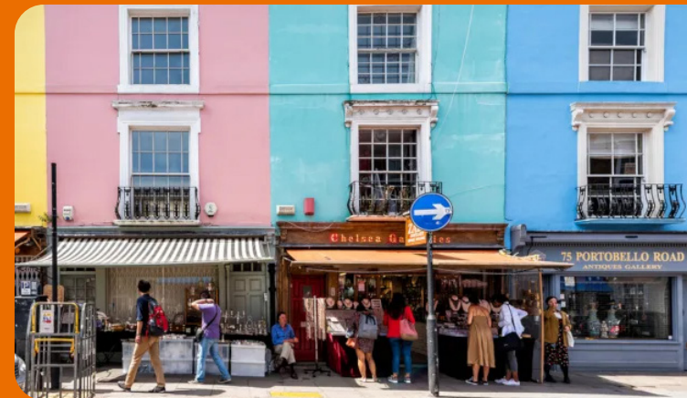
Notting Hill, London

Mixed use Residential (HMO) and Commercial portfolio comprising 7 separate properties.